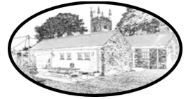
Registered Charity in England and Wales No. 1171103

https://register-of-charities.charitycommission.gov.uk/charity-search/-/charity-details/5089715 or simply enter "Pillaton Village Hall CIO" into Google.