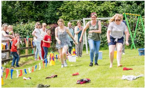
Some competitive racing at the Fun Day.