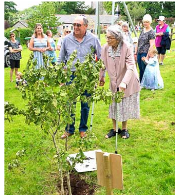
Planting the oak tree.