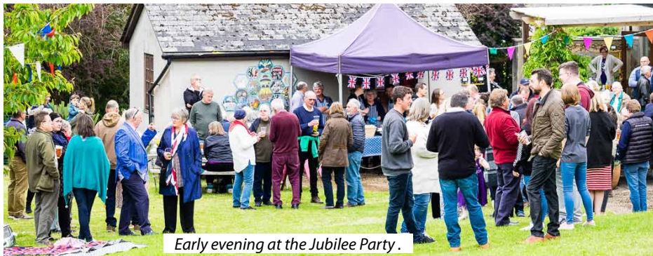
Early evening at the Jubilee Party.