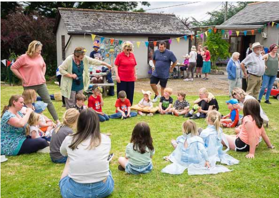
Games at the Family Fun Day

The next event was the Family Fun Day held on the Friday. Fortunately, the afternoon was blessed with fine sunny weather and allowed many families and friends to enjoy a range of activities such as a Fancy