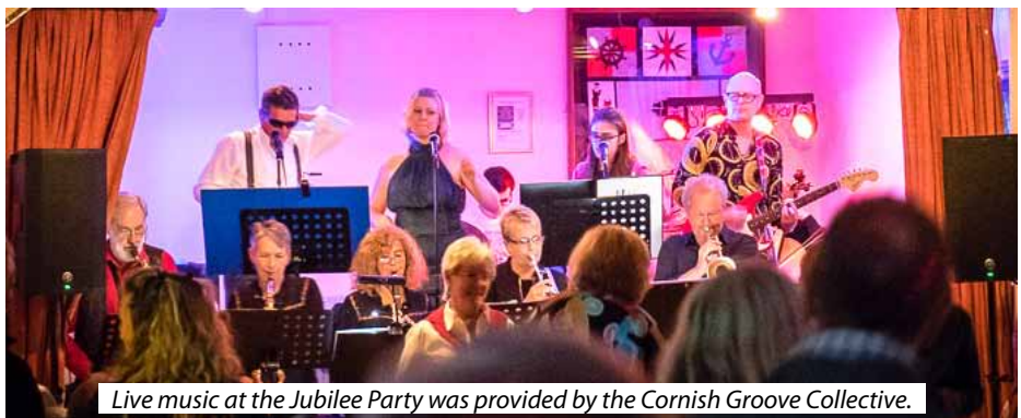
Live music at the Jubilee Party was provided by the Cornish Groove Collective.