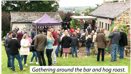
Gathering around the bar and hog roast.