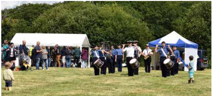
Torpoint Sea Cadets Marching Band