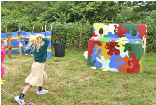
The Wet Sponge Stocks

Once again, the Cherry Feast was a fabulous success. After weeks of following the long range forecast we were eventually rewarded with a fine display of Cornish summer weather. Friday, the original set up day, was a complete wash out but Saturday was lovely so we did manage to put up the tents and scatter tables and chairs around the field, although a couple of the tents had to be secured to farm vehicles to stop them blowing