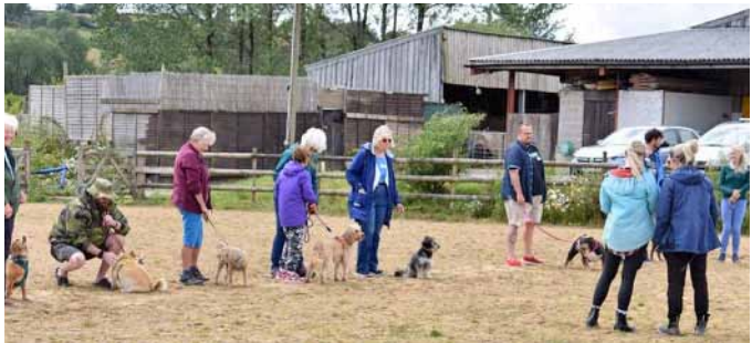
The Dog Show