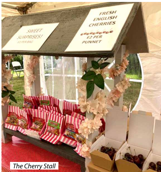
The Cherry Stall

Despite some uncertain and changeable weather the annual Cherry Feast held on Sunday 7 July at Bush Farm proved once again to be a great success with over £4,000 being raised.