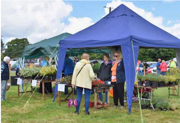
The Garden Plant Stall