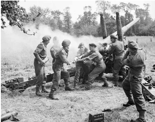
4.5-inch gun of 211 Battery, 64 th Medium Regiment, RA near Caen 13 June 1944

Back to D-Day; father's regiment, 64 Medium Regiment Royal Artillery, equipped with 4.5- and 5.5-inch howitzers, and part of 5 Army Group Royal Artillery, did not land on D-Day itself. Instead on 5 and 6 June the regiment were in transports in the Channel area, awaiting the move to the beaches, but also acting as a decoy to convince the Germans the assault was intended for the Pas de Calais area. Father, who rarely talked about wartime experiences, did disclose that he found it a very unpleasant experience to be sitting in near stationary shipping, all packed full