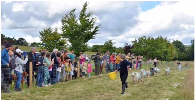
The Sheep Race, a new event