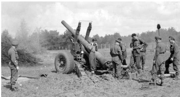
5.5-inch field gun of 64 th Medium Regiment, RA, firing on Bremen, 24 April 1945