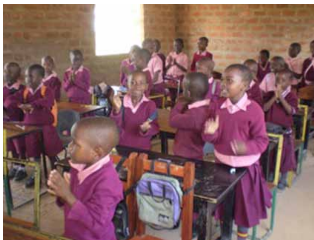
One of the classes at the school

they are doing, coming regularly top of their district in the regular exams they have to take.