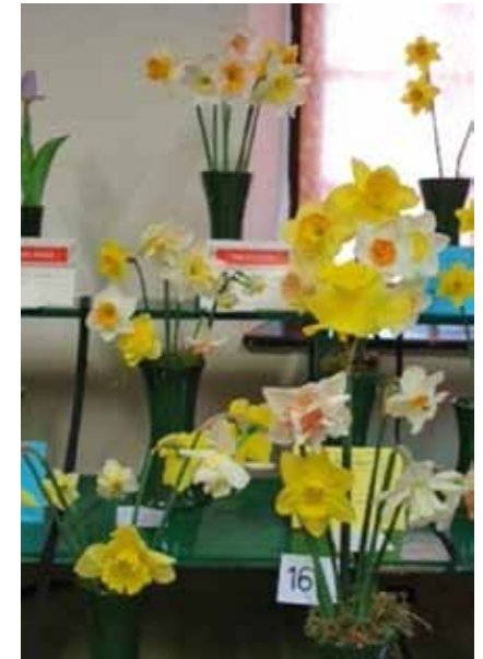
Some of the exhibits at the Pillaton Gardening Club Spring Show