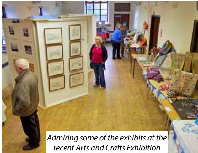
Admiring some of the exhibits at the recent Arts and Crafts Exhibition