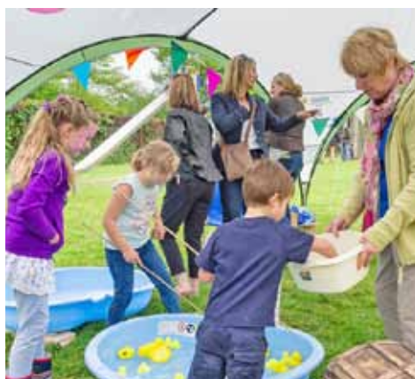
Hook a duck