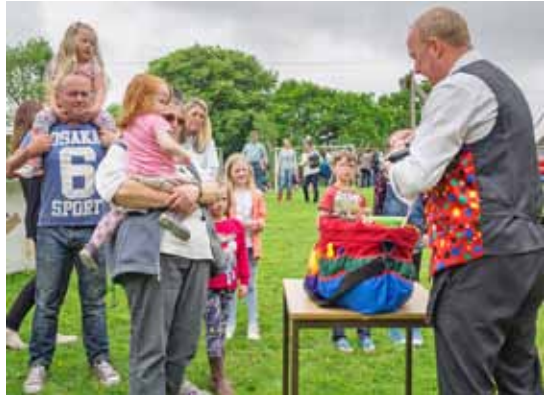
A bit of magic

My heartfelt thanks to all who helped make the Family Fun Day such a success, especially as it involved an enormous amount of advance preparation and sheer hard work, before during and after the event. To the long suffering Committee, the additional volunteers who helped whether it was with setting up, running stalls or events, or helping with the mammoth tidy up, the first aiders, and our contractors - thank you to you all. And apologies if I have left anybody out.