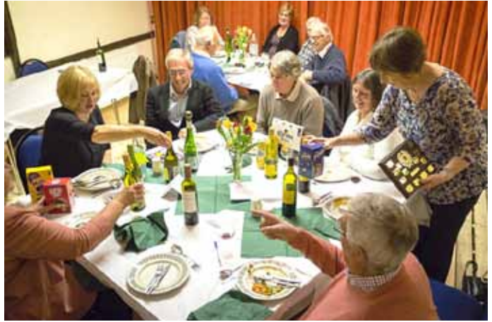
The winning Knackered Monks team