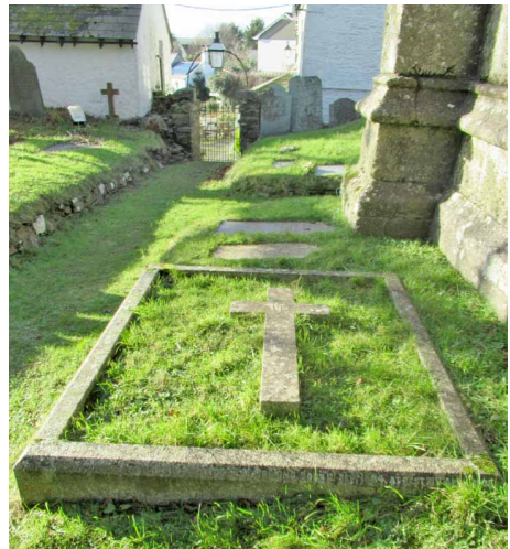
The Hocking family grave by the church door