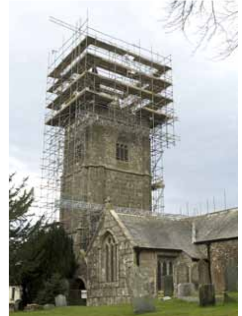
The church tower encased in scaffolding

The church tower is now encased in scaffolding, with preparations being made to remove the remainder of the damaged pinnacle from the roof of the tower and replace it with a new one. As much of the original will be replaced in situ and the pieces damaged beyond repair will be formed from Cornish granite. Parts of the old pinnacle will also be used to form a memorial to the event in the church grounds. A protective cover has been made and is now protecting the font, all the pews and the altar have been protected. The timber in the tower roof is more damaged than originally thought, as a granite bounced on the roof and damaged the joists. It is probable that about three quarters of the lead will have to be stripped and relaid. The bell frame will also be inspected to ensure no damage was sustained.