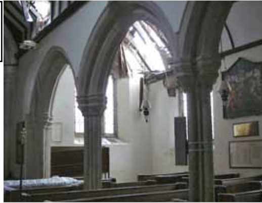
The largest of five holes in the church roof

On 1 February a packed meeting was held at The Weary Friar to discuss the repairs and long term future of St Odulph's Church. The opportunity was taken to examine ideas for alternative uses of the church in addition to services of worship, possible material upgrades to improve the current facilities and fund-