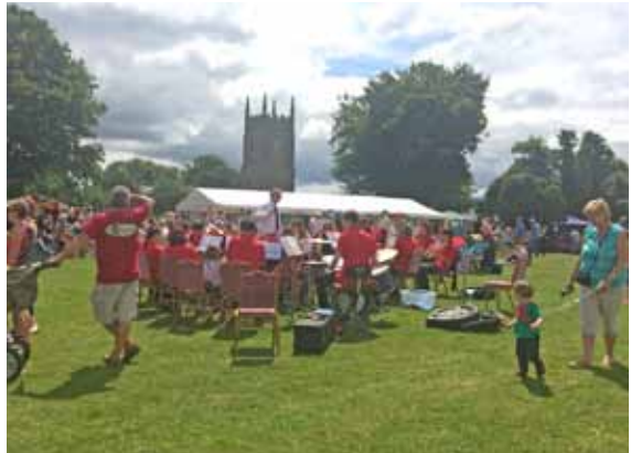
The Laira Youth Band at this year's Cherry Feast