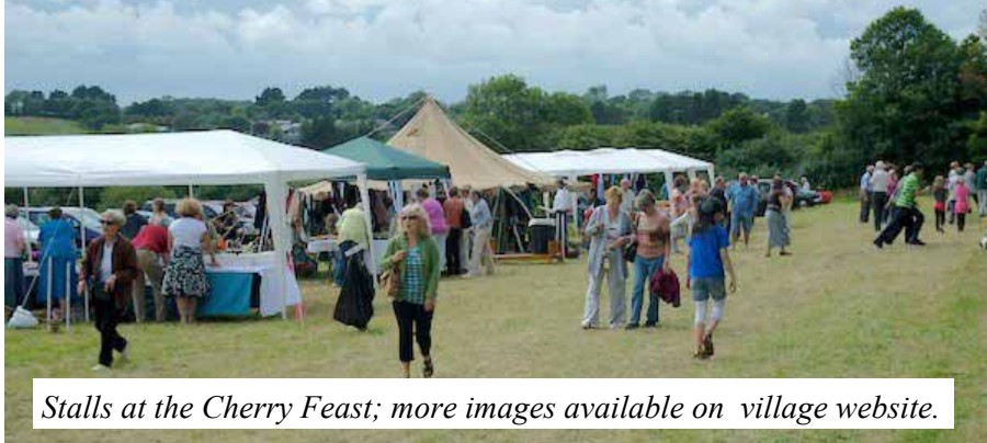
Stalls at the Cherry Feast; more images available on village website.