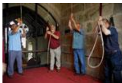
Tower Bell Ringers