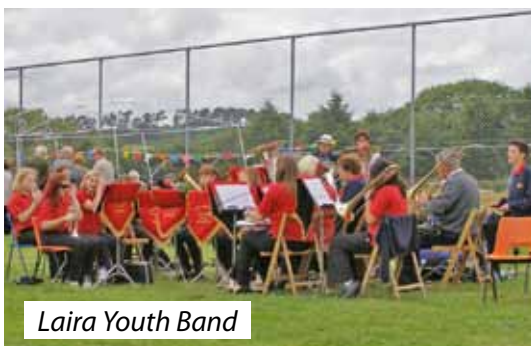
Laura Youth Band