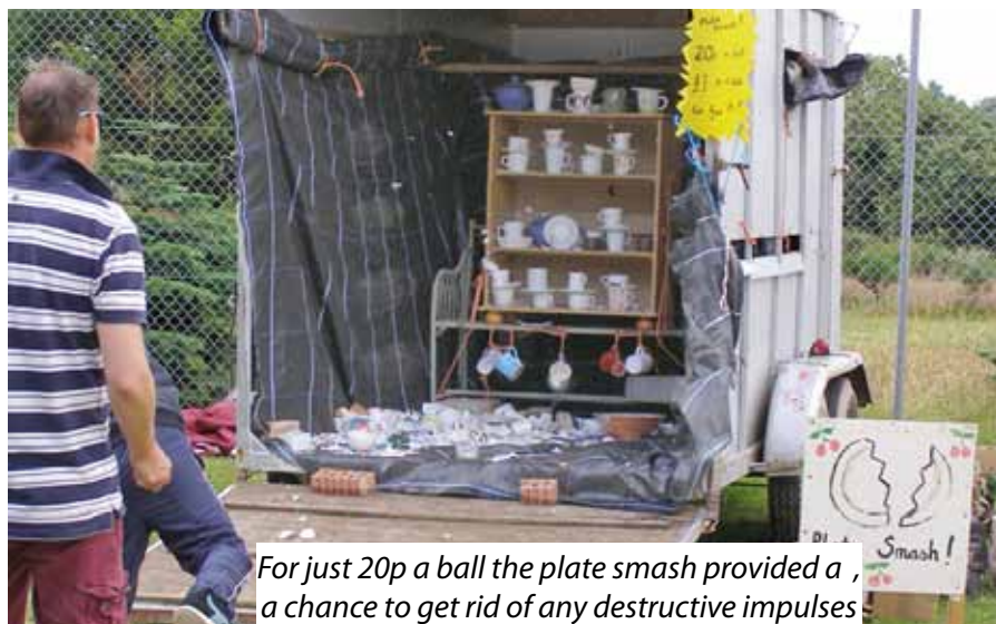
For just 20p a ball the plate smash provided a , a chance to get rid of any destructive impulses