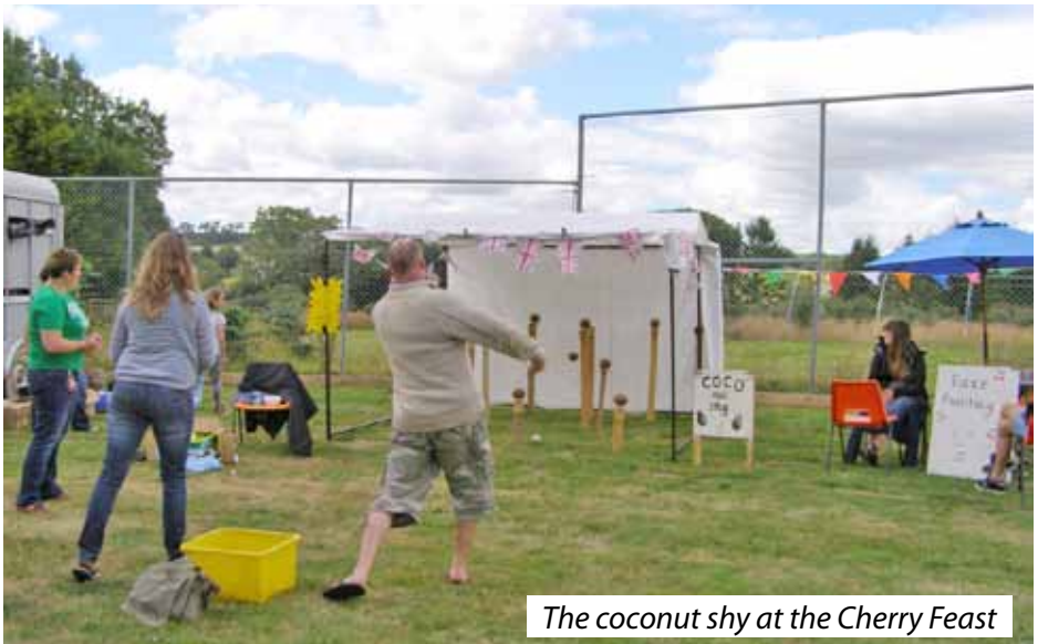
The coconut shy at the Cherry Feast

(For more pictures and details, see pages 12 and 13)