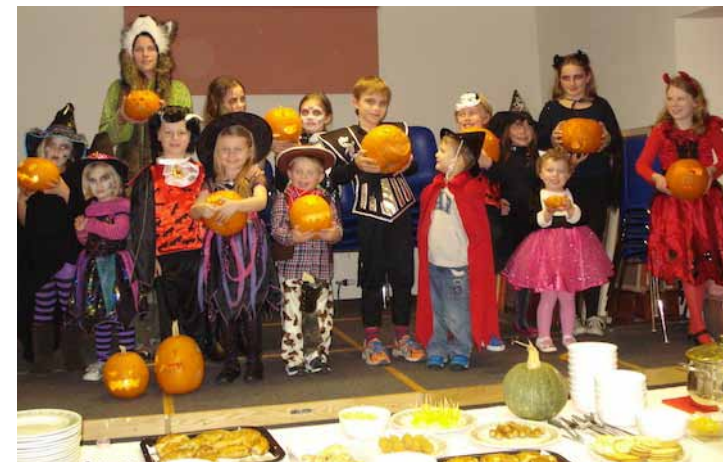
Local children with their pumpkin lanterns

Gardening Club arranged a Pumpkin Festival in the Village Hall. As well as displaying their hand carved pumpkin lanterns, many of the children wore fancy dress and enjoyed a range of pumpkin based food.