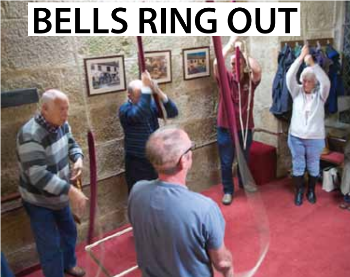
Pillaton's bells ring out again

On 22 October, having been forced into silence following lightning bolt damage to the church nine months ago, Pillaton's church bells have rung out once more over the village. Repairs to the church and tower have reached the stage where some of the facilities are again available for use and the regular Tuesday evening bell practice was held in the tower for the first time since January.