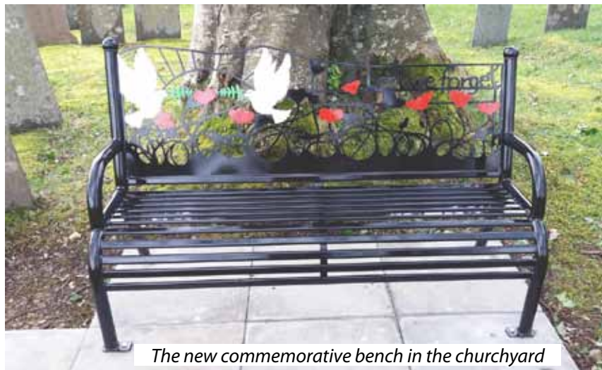
The new commemorative bench in the churchyard

Whilst it may appear the Group has gone into hibernation over the winter, in fact much has been happening behind the scenes, and new projects have come to fruition recently.