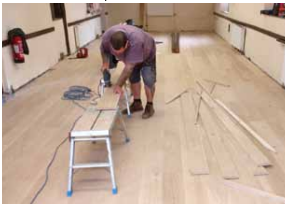
Work in progress re-laying the Village Hall floor.

Three estimates for the redecoration were obtained and this work will be carried out before the hall is reopened.