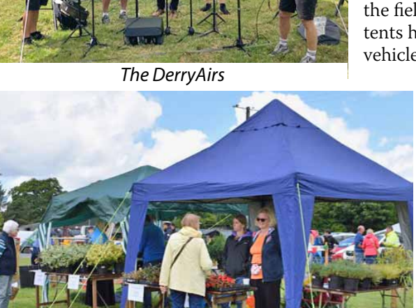
The Garden Plant Stall