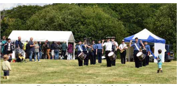
Torpoint Sea Cadets Marching Band