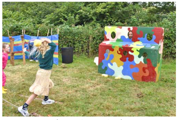
The Wet Sponge Stocks

Once again, the Cherry Feast was a fabulous success. After weeks of following the long range forecast we were eventually rewarded with a fine display of Cornish summer weather. Friday, the original set up day, was a complete wash out but Saturday was lovely so we did manage to put up the tents and scatter tables and chairs around the field, although a couple of the tents had to be secured to farm vehicles to stop them blowing