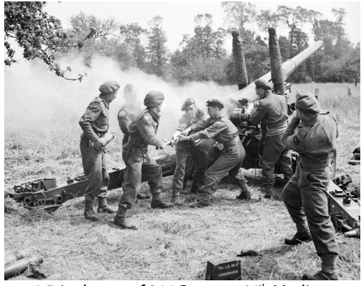
4.5-inch gun of 211 Battery, 64th Medium Regiment, RA near Caen 13 June 1944

Back to D-Day; father's regiment, 64 Medium Regiment Royal Artillery, equipped with 4.5- and 5.5-inch howitzers, and part of 5 Army Group Royal Artillery, did not land on D-Day itself. Instead on 5 and 6 June the regiment were in transports in the Channel area, awaiting the move to the beaches, but also acting as a decoy to convince the Germans the assault was intended for the Pas de Calais area. Father, who rarely talked about wartime experiences, did disclose that he found it a very unpleasant experience to be sitting in near stationary shipping, all packed full