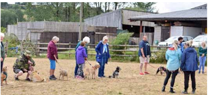
The Dog Show