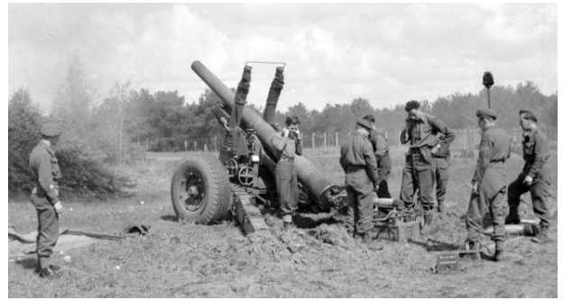
5.5-inch field gun of 64<sup>th</sup> Medium Regiment, RA, firing on Bremen, 24 April 1945