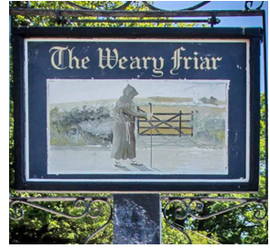
The old faded sign, which will be remembered by many in the village.

Meanwhile Trina painted the other (west facing) side using the design produced by Alison Downing, pictured right.