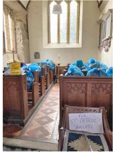
Bags of winter clothes and bedding in St Odulph's Church awaiting transport to Truro.