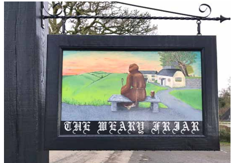
Close-ups of the east and west facing sides of the new sign.