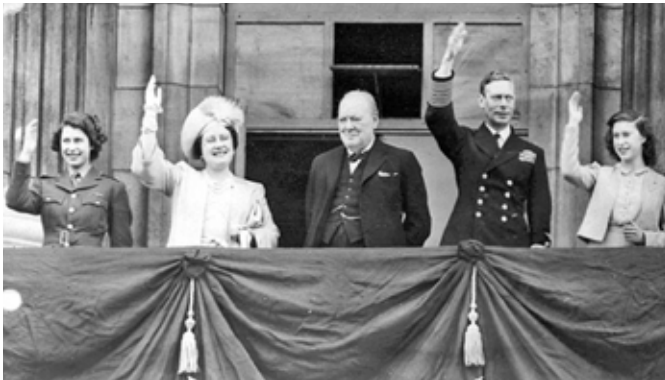
The Royal Family and Winston Churchill greeting the crowds from the balcony at Buckingham Palace on VE Day.

and others mourned lost ones, whether casualties in the Armed Forces, or civilian victims of the war. There were also the seriously wounded and injured (including those bearing mental scars), who would never fully recover. And of course, the killing was still going on in the Far East, where victory against Japan would not be achieved for another three months. The killing also continued within both recently liberated and conquered countries, from the settling of old scores and the brutality of factions seeking control in the vacuum left by defeat or liberation. However, the celebration of our troops in Germany and Italy was much more nuanced: some celebrated uproariously, but many others found celebrating wholly inappropriate when thinking of those lost, or were too tired (mentally and physically) to indulge in any festivities. My own father, serving in 30 Corps in north Germany, remembers