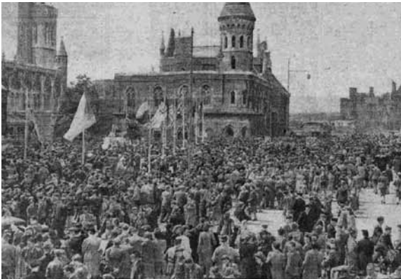
Expectant crowds outside St Andrews' and the Guildhall.

GREAT NEWS ANY MOMENT King And Premier To Broadcast WORLD AWAITS END OF GERMAN WAR