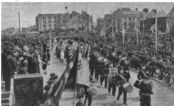
Thanksgiving Parade marches past on 13 May 1945.