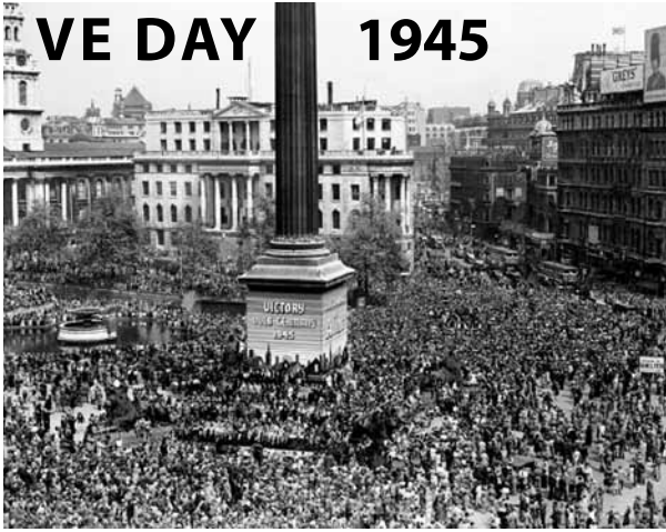
Crowds in Trafalgar Square on VE Day.

and others mourned lost ones, whether casualties in the Armed Forces, or civilian victims of the war. There were also the seriously wounded and injured (including those bearing mental scars), who would never fully recover. And of course, the killing was still going on in the Far East, where victory against Japan would not be achieved for another three months. The killing also continued within both recently liberated and conquered countries, from the settling of old scores and the brutality of factions seeking control in the vacuum left by defeat or liberation. However, the celebration of our troops in Germany and Italy was much more nuanced: some celebrated uproariously, but many others found celebrating wholly inappropriate when thinking of those lost, or were too tired (mentally and physically) to indulge in any festivities. My own father, serving in 30 Corps in north Germany, remembers