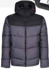
REGATTA PROFESSIONAL REGIME JACKET DARK IRON/BLACK