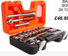
BAHCO S240 SOCKET SET 24 1/2IN DRIVE £46.99 Inc Vat