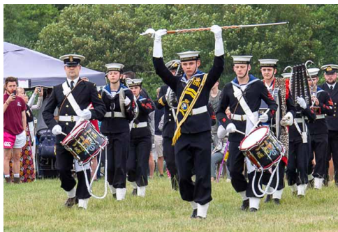
Torpoint Sea Cadet Band.

On Sunday 2 July after a gap of four years the annual Cherry Feast made a welcome return. Fortunately, the weather behaved itself, with just a few drops of rain, and the event, held in the new venue of Bush Farm was well attended. The proceeds from the Cherry Feast all go towards the upkeep of the churches in Pillaton and St Mellion and this year's results matched that of the last event in 2019. Full report on pages 8 and 9.