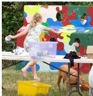
Any volunteers for a wet sponge.