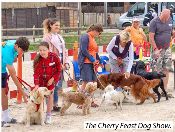
The Cherry Feast Dog Show.