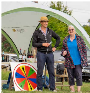
The Wine Wheel raised £180.

On Sunday 2 July after a gap of four years the annual Cherry Feast made a welcome return. Fortunately, the weather behaved itself, with just a few drops of rain, and the event, held in the new venue of Bush Farm was well attended. The proceeds from the Cherry Feast all go towards the upkeep of the churches in Pillaton and St Mellion and this year's results matched that of the last event in 2019. Full report on pages 8 and 9.