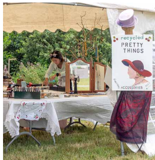
The ever popular Pretty Things stall.