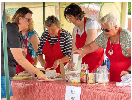
Busy in the tea tent.